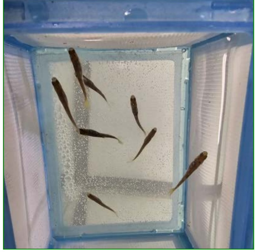
Students at Divine Mercy Catholic Academy East observe rainbow trout fry in their classroom aquarium. Left photo by Tina Teno. Right by Melissa Reckner.